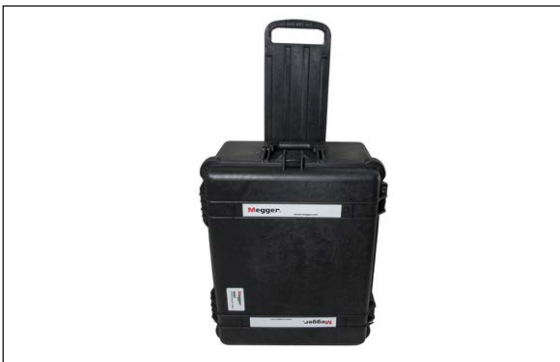
Transport case (GD-30090) with wheels and space for cables and accessories.