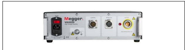
VAX020, 2 kV amplifier, AF-59090