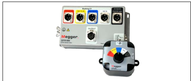
DFR500 Switchbox, AG-98090