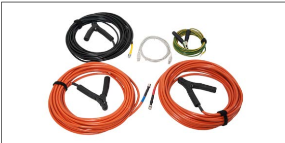
Picture shows some of the included accessories. Generator cable, USB cable, ground cable, and measurement cables.